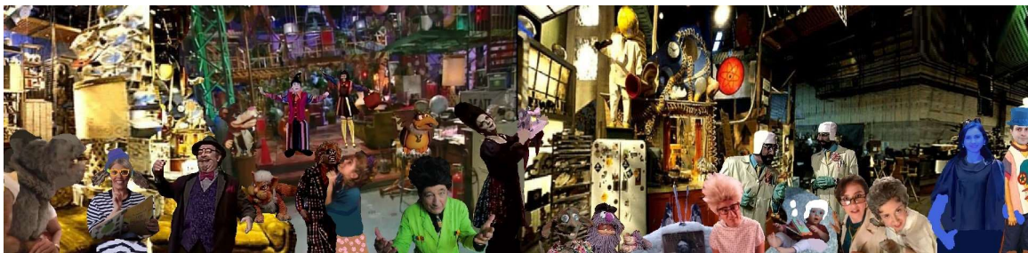
Originally posted in "Beakman Fans" on May 20, 2020.